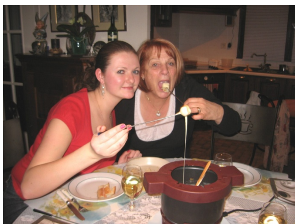
Student eating fondue with her host-mum

Time will be shared with the family to encourage communication and cultural exchange.